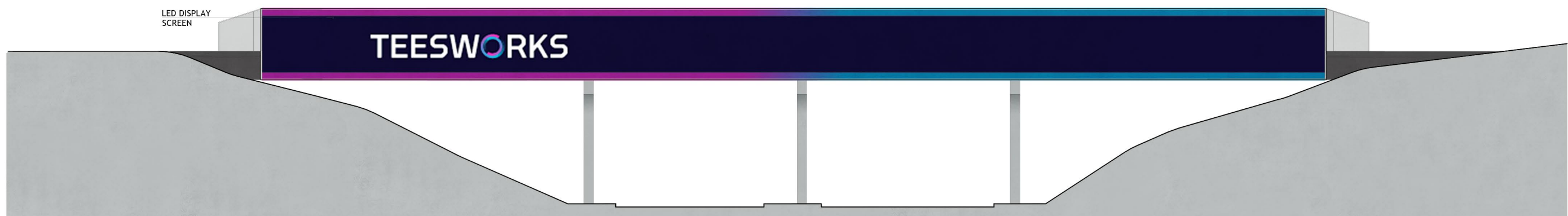
Bridge as Proposed