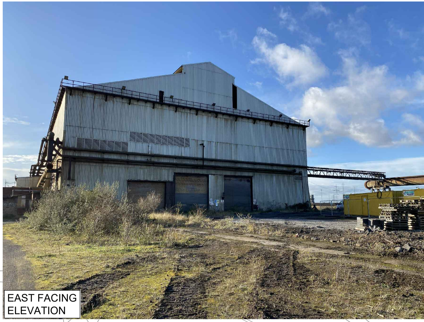
EAST FACING ELEVATION