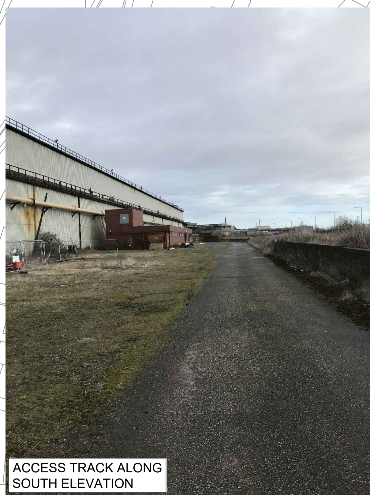
ACCESS TRACK ALONG SOUTH ELEVATION