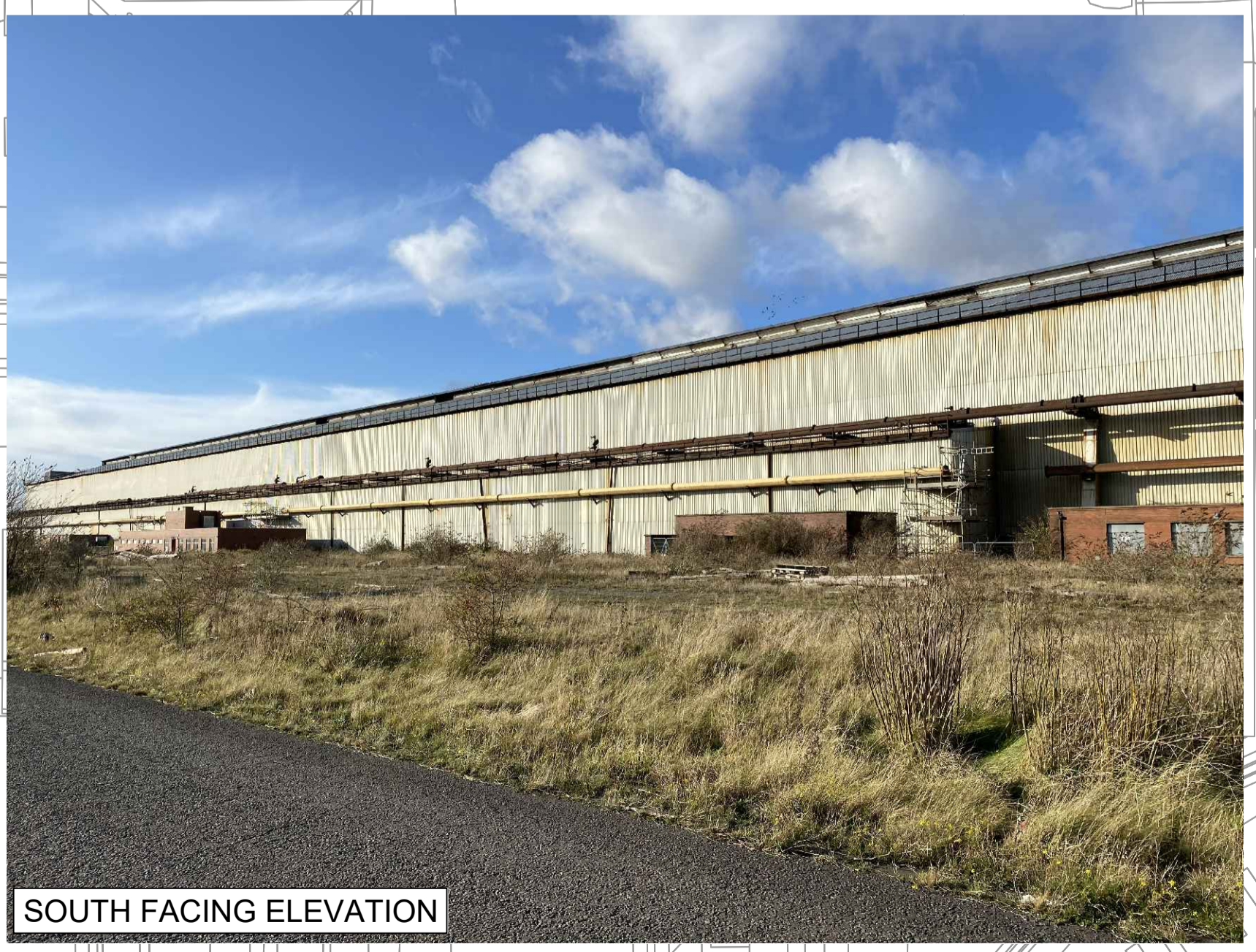
SOUTH FACING ELEVATION