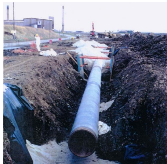
Construction Images of the 36" pipeline routing through South Tees industrial sites