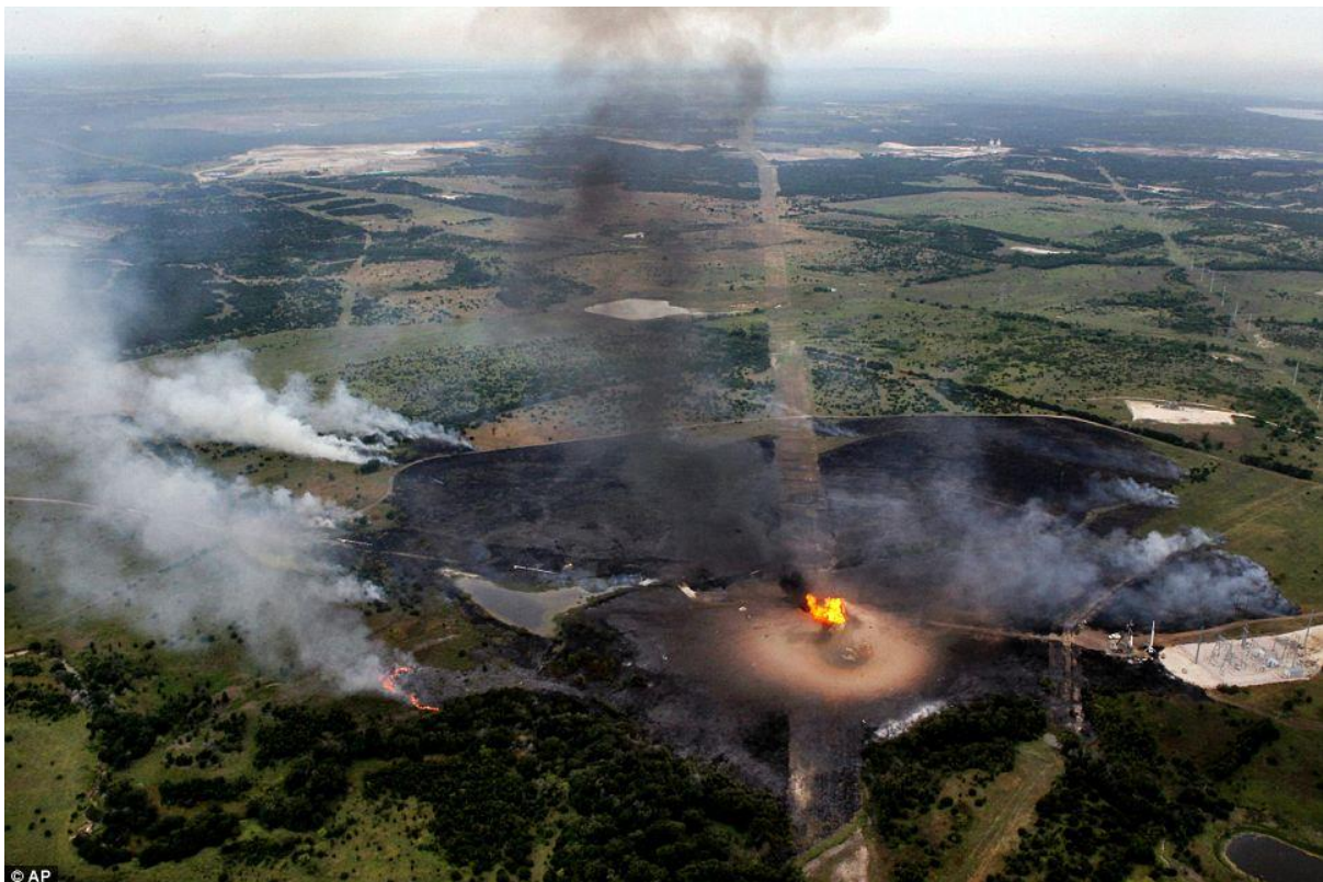
36" Gas Pipeline Explosion, North Texas June 7, 2010

N.B. IN THE EVENT OF A CATS PIPELINE LEAK OCCURRING OBSERVE THE ABOVE PRECAUTIONS BUT DO NOT ATTEMPT TO STOP THE LEAK