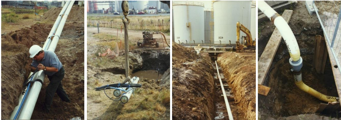
Construction Images of 6" exports in various locations in Seal Sands