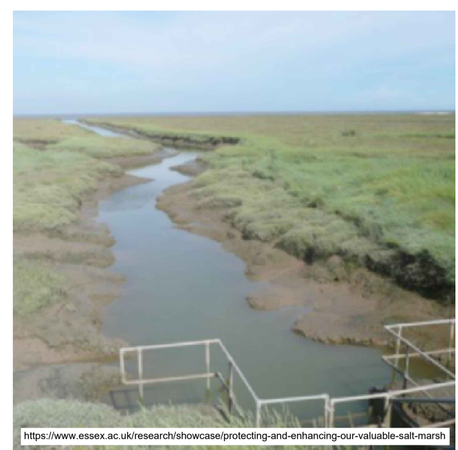
EXAMPLE OF THE LONG TERM ASPIRATIONAL SALT MARSH HABITAT TO ESTABLISH THROUGH TIDAL SEDIMENT ACCRETION AND SELF VEGETATION