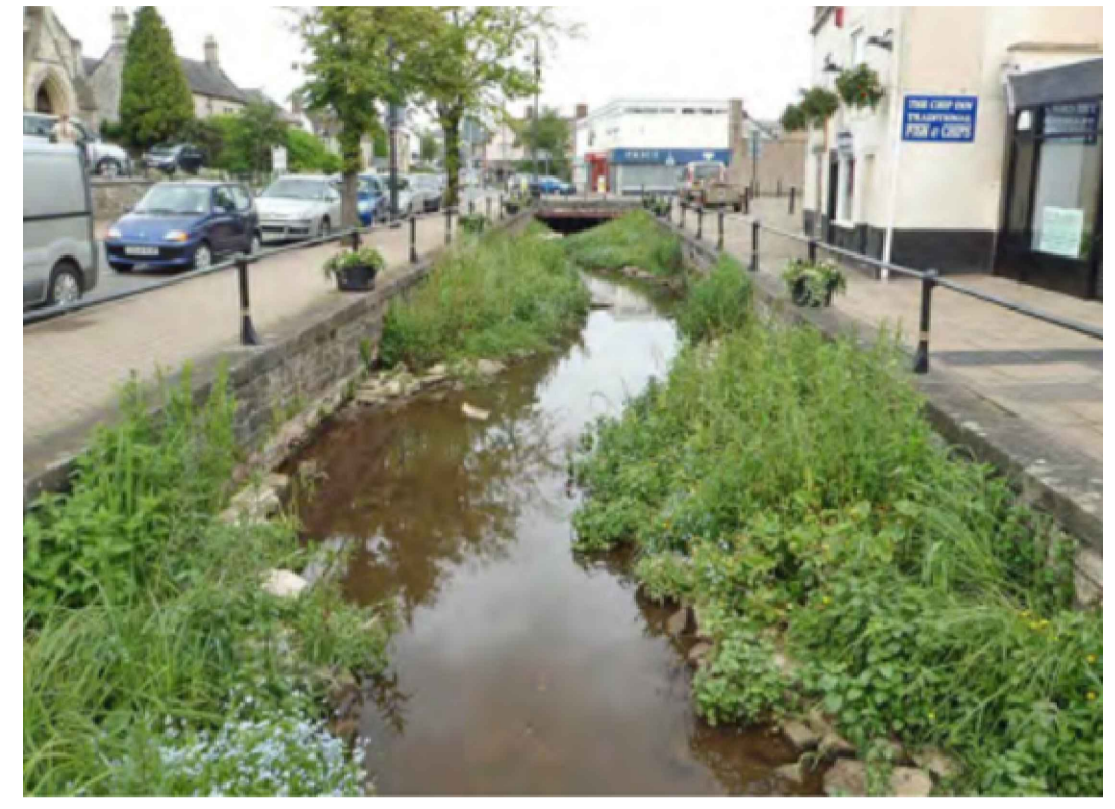
EXAMPLE OF LOW LEVEL VEGETATED BERM FORMATION IN AN URBAN CHANNEL, MANUAL OF RIVER RESTORATION TECHNIQUES