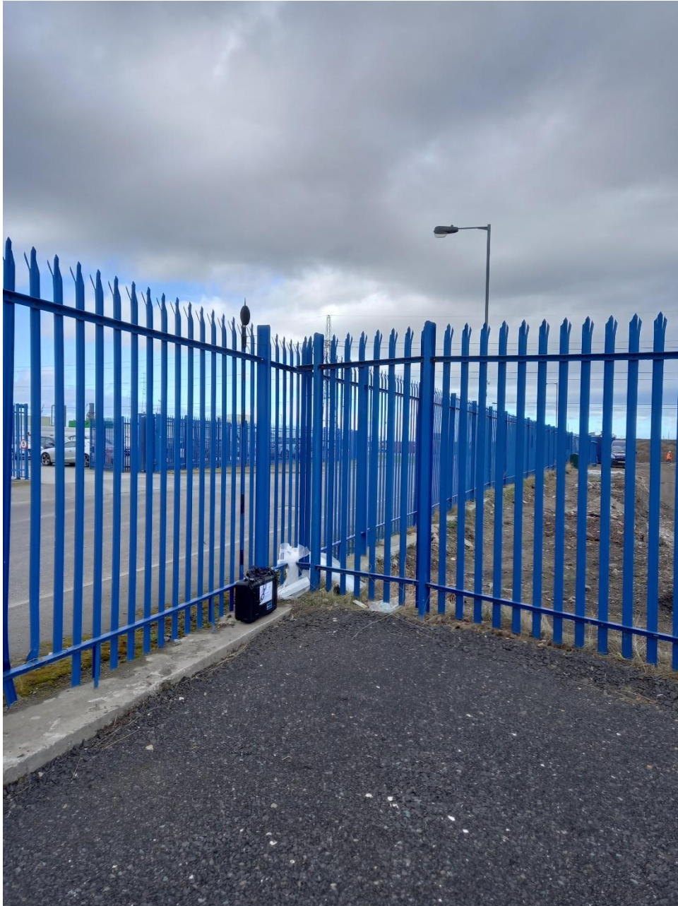
Figure B.1: Long-term monitoring set up