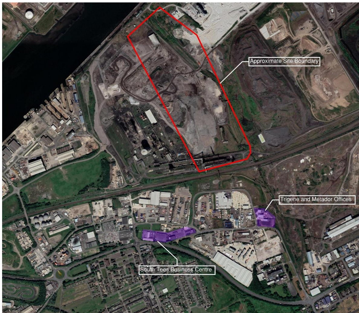
Figure 1.1: Commercial receptor and site location