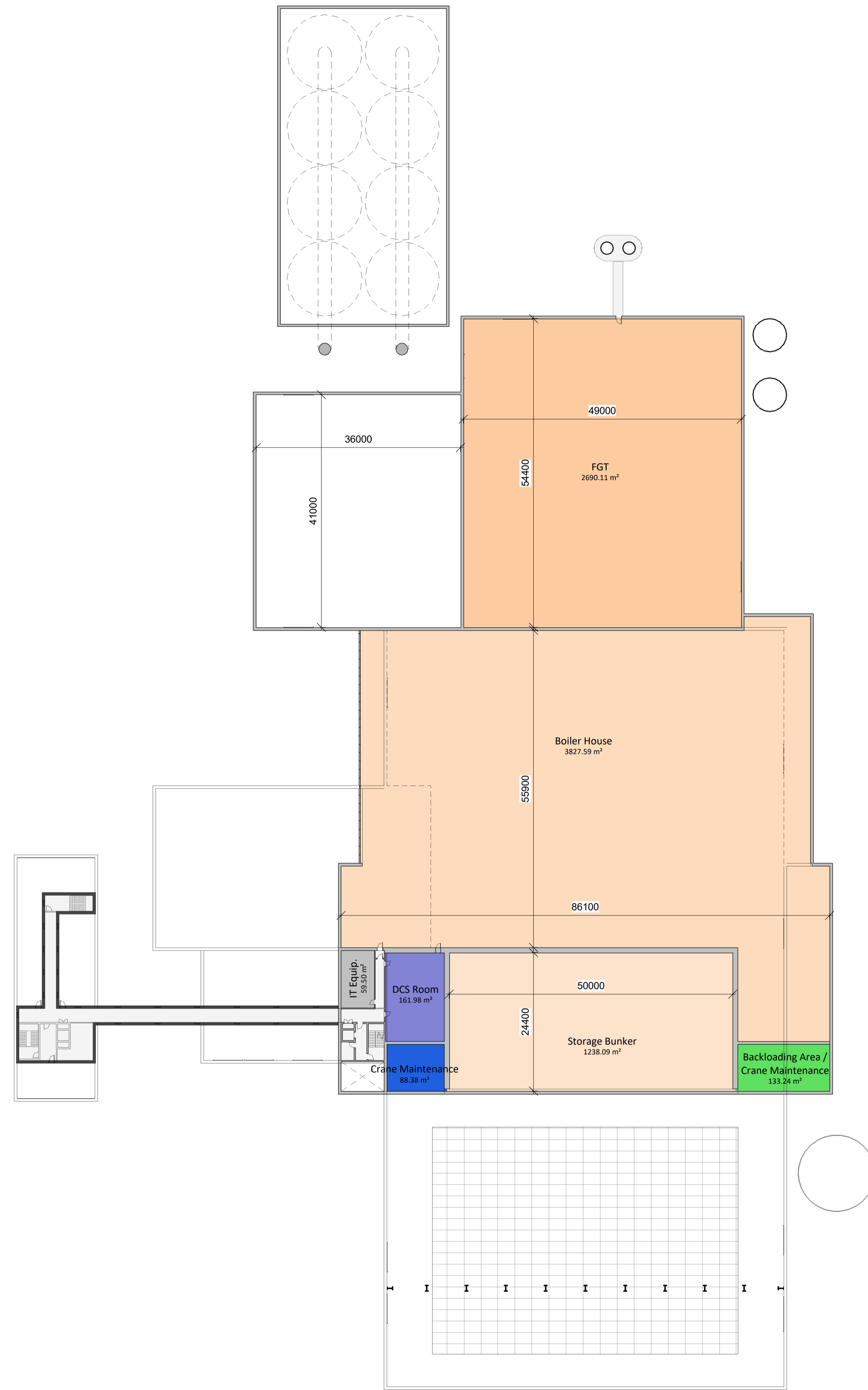
GA Plan_Level 04_+16.00m