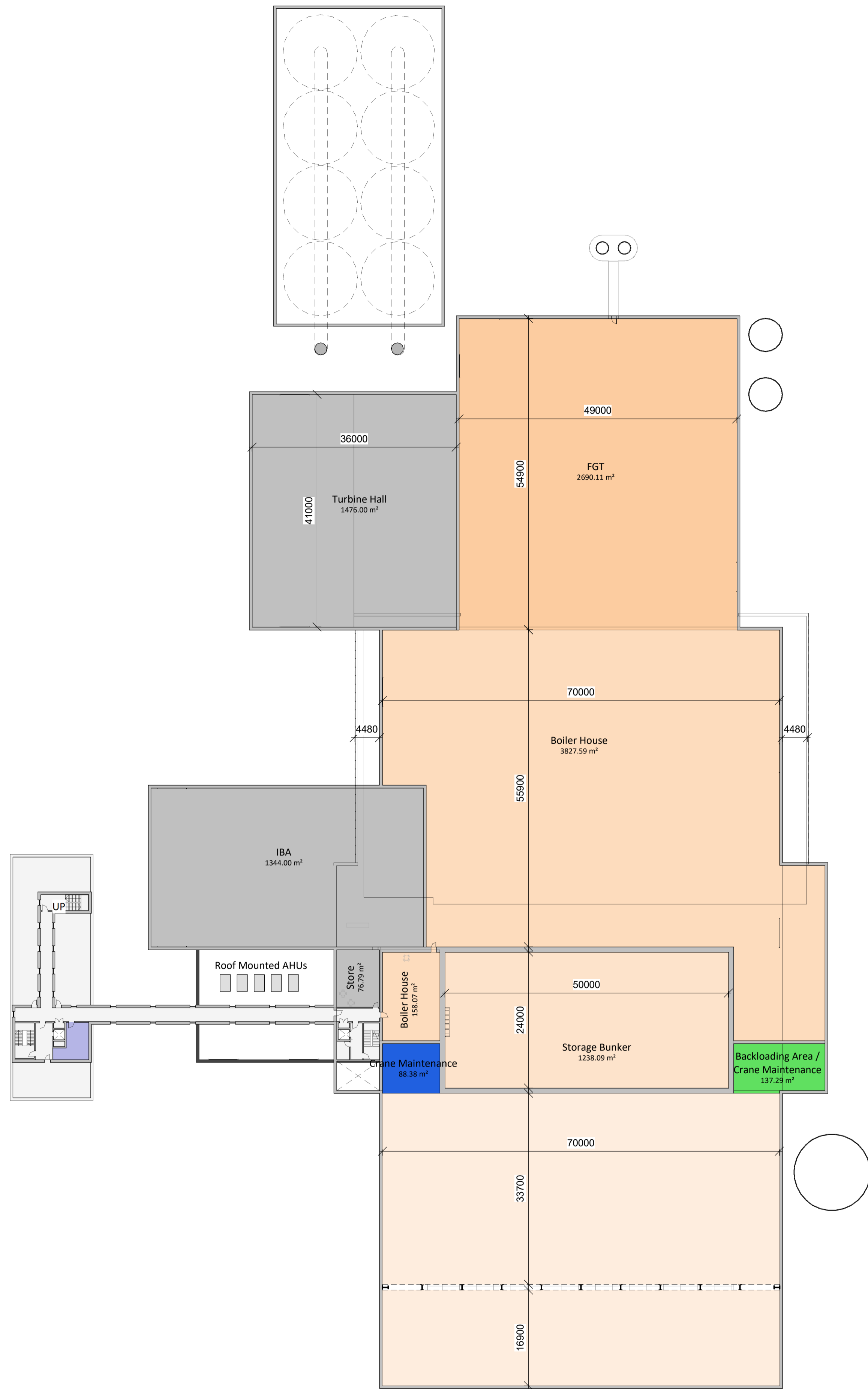
GA Plan_Level 03_+12.00m